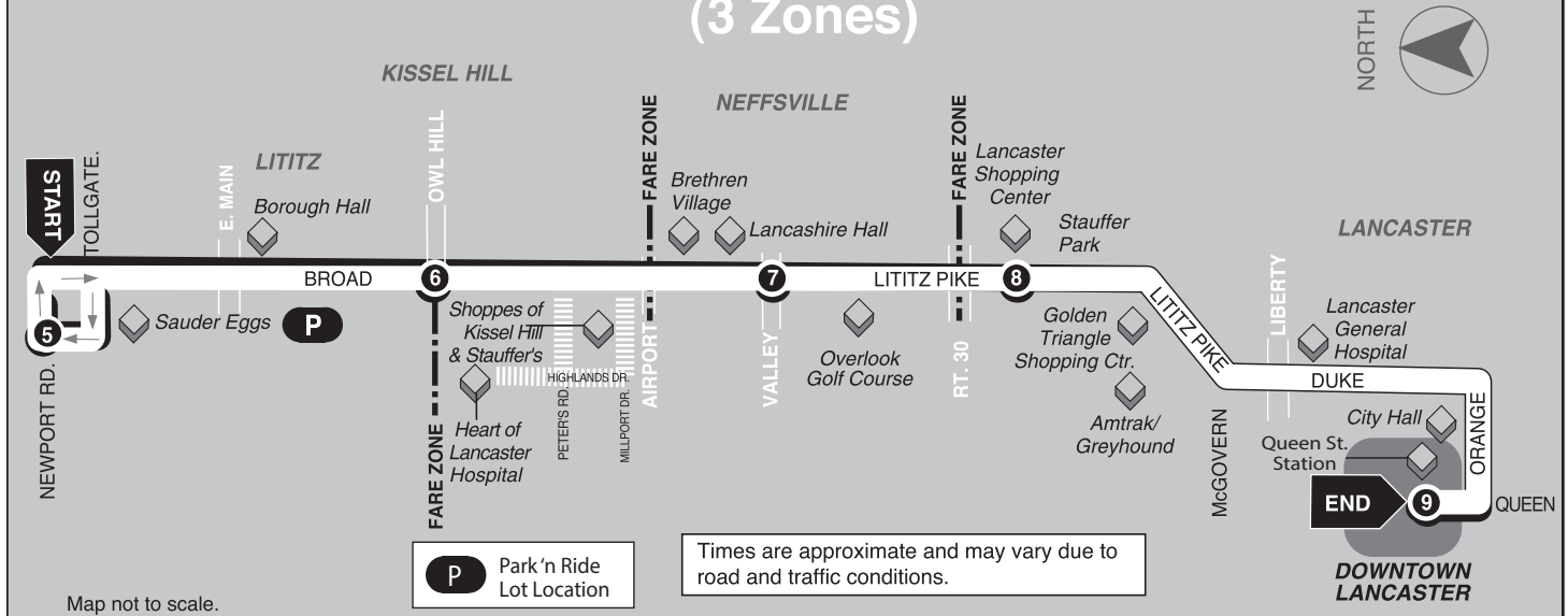
Map not to scale.